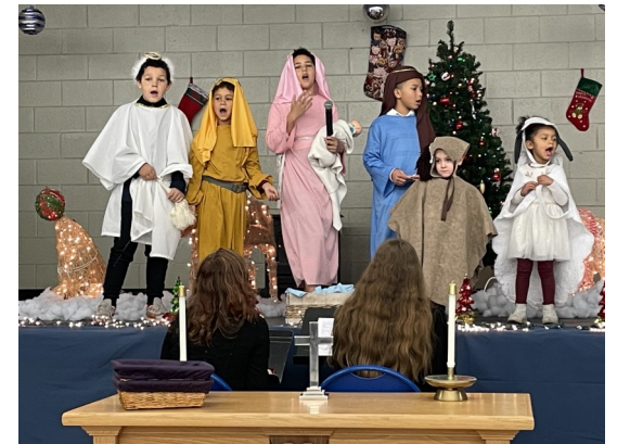
Silent Night, Holy Night

*Thank you Westside!!! ...for your generous giving again this (past) year to our Deacons' Thanksgiving Benevolence Offering and 2022 Loaves & Fishes Hunger Offering . You are a blessing in Christ to your church and community (and beyond)!