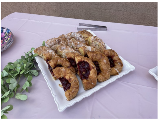
Did we mention food?