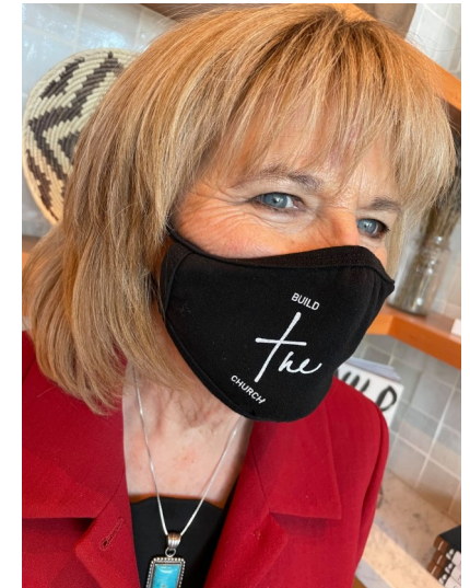
"Build the Church"

it's MASK IT UP MARCH!!! TO ORDER your MASK WITH A MESSAGE in support of our Building Campaign, go to westsidecpc.org and click Build the Church Fundraisers . ($10 suggested donation) Thank you!!!